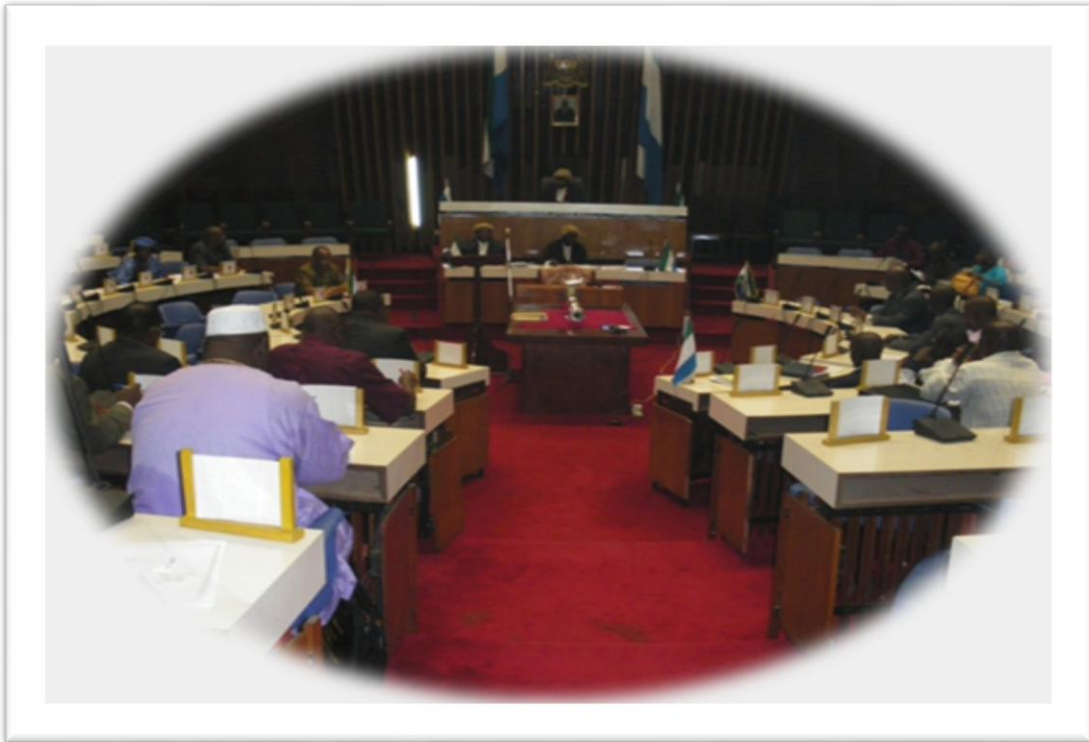
THE CHAMBER OF PARLIAMENT OF THE REPUBLIC OF SIERRA LEONE